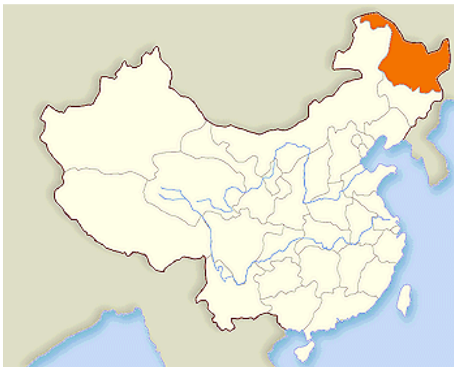
Province of Heilongjiang

Heilongjiang Province, which has always been a dairy province, is the second-largest cultivation centre of milk cows after Inner Mongolia. The province is situated in the so-called "golden-belt" of sweet corn and cow and has an excellent environment for the dairy industry. With the active support of the provincial and state government, there are plenty of opportunities for both local and international players in the dairy industry. This report, written by the Netherlands Business Support Office in Dalian, gives a brief introduction of the dairy industry in Heilongjiang and its opportunities. The NBSO Dalian supports Dutch SME's to do business in China's Northeastern region.