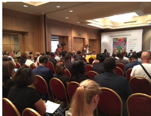
Attendees of the conference