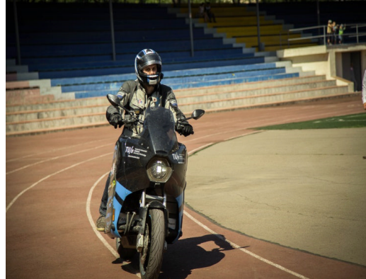
Presentation of the electric touring motorcycle in Almaty

The event was co-organized by the STORM Eindhoven, the Netherlands Embassy and one of the leading business universities in Kazakhstan, Narxoz University, and included a seminar on Dutch innovations and a promo-presentation of the electric touring motorcycle. The Narxoz University provided warm hospitality and great support to the STORM Group during their stay in Almaty.