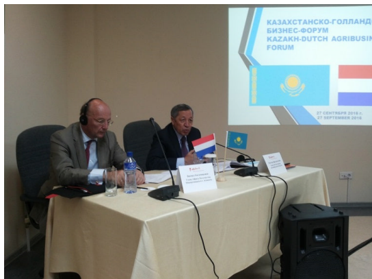
Dutch and Kazakh officials open the Agribusiness Forum

they offer. The forum achieved very good attendance level with over 80 people participating in the meeting. At the end of the official part stakeholders from the agricultural sector were invited for individual meetings with Dutch companies in a separate meeting room. During the matchmaking local agribusinesses could not only exchange contacts with representatives of Dutch companies, but also ask questions related to the Dutch agricultural equipment and machinery.