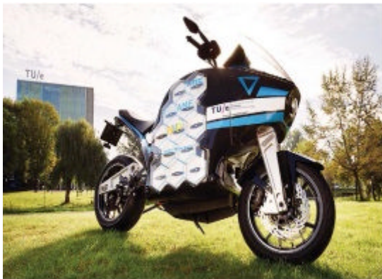
Electric touring motorcycle

The main purpose of their visit was to promote Dutch technologies in the field of sustainable transport, in general, and to promote their invention, the electric touring motorcycle, in particular. Their visit to Almaty was part of their 80-day world tour during which they’d had plans to visit different countries on different continents and spread the word about Dutch innovations and their technological invention.