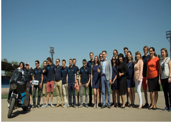
STORM Eindhoven Team in Almaty