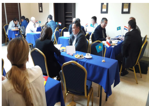
Individual meetings between Dutch and Kazakh companies