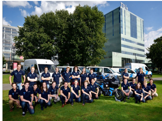
STORM Eindhoven Team