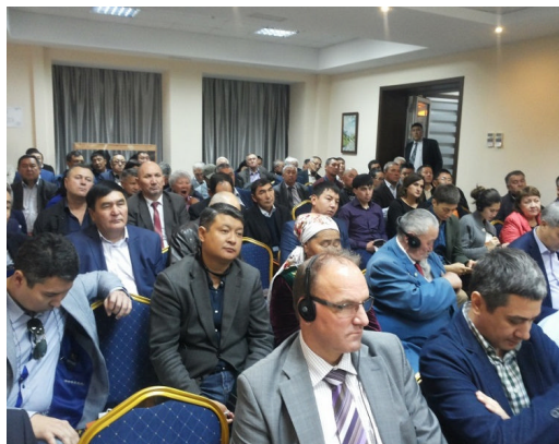
Attendees of the Agribusiness Forum